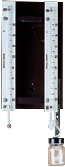
Kew Pattern Hygrometer

This is a high quality hygrometer using accurate stem-divided, mercury-filled thermometers, which are made with consideration to BMO patterns. The thermometers are fitted to laminated plastic mounts, which have been engraved with thermometer divisions. The mounts themselves are then fitted onto a laminated plastic back-plate, moulded from high strength, 'warp resistant' plastic.