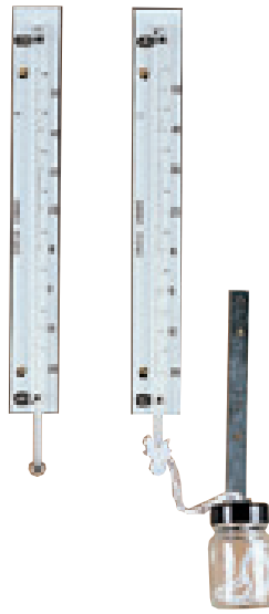
Simple Pattern Hygrometer

A metal bracket attached to the back plate, supports the water reservoir from which a cotton wick runs and is threaded around a circle of muslin covering the bulb of one of the thermometers. The bulb is kept constantly wet by capillary action.